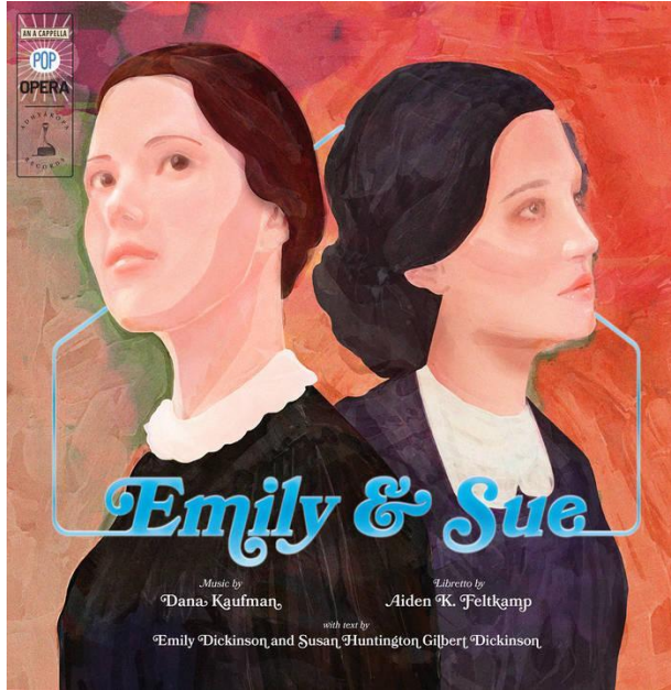
Album cover design Setty Hopkins